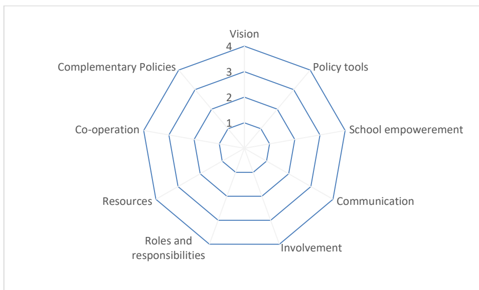
Figure 2. Gauging progress with the education response strategy

Once you have identified the least developed part of your implementation strategy, you can switch back to the planning tool (Table 1), and initiate actions to strengthen it. The continuous iteration between these two tools will provide support for the development of a coherent implementation strategy to ensure effective change aligned to the education response.